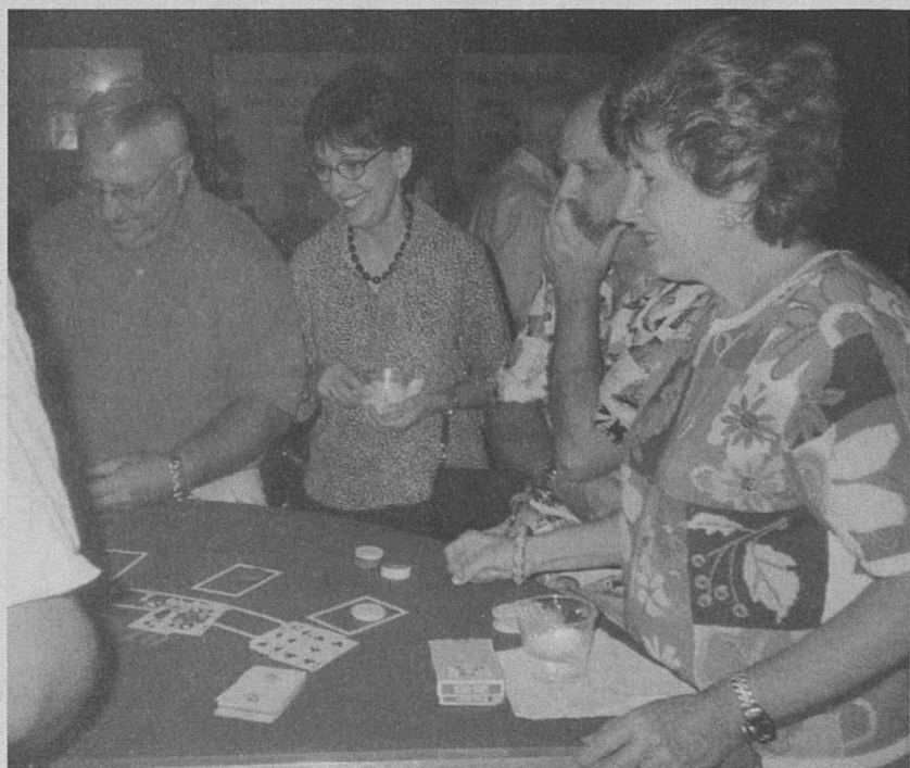
Las Vegas Night